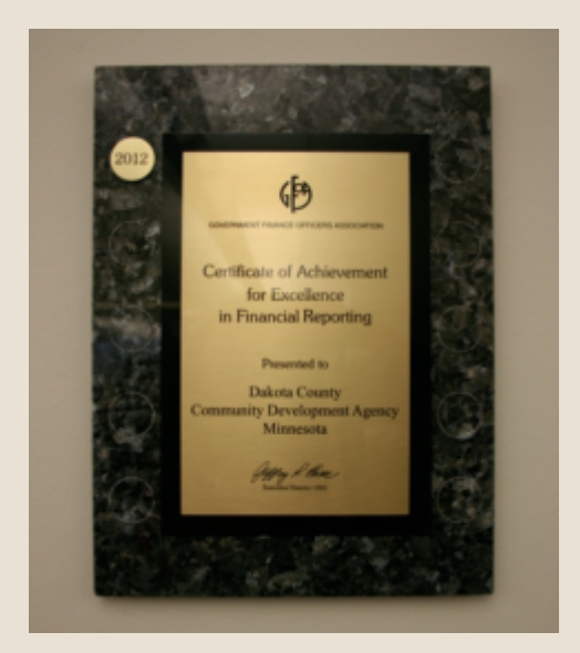
The new plaque for the Certificate of Excellence in Financial Reporting awarded by the Government Finance Officers Association.