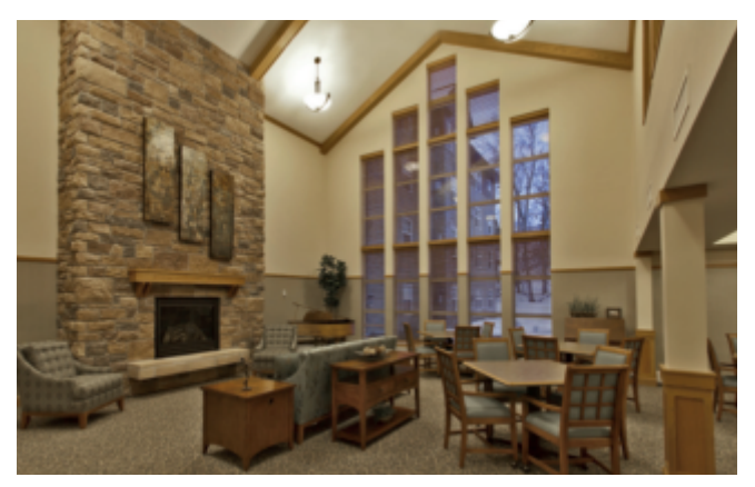
The Senior Housing Program provides independent living apartments throughout Dakota County.

The CDA has administered the Housing Choice Voucher Program since 1977 and our allocation of vouchers has grown modestly over the years to just over 2,300 vouchers in size. This past May, the CDA was invited to apply for Veterans Affairs Supportive Housing (VASH) vouchers. The HUD-VASH program combines Housing Choice