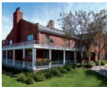
Main Street Manor