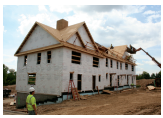
Inver Hills Townhomes construction began in 2013