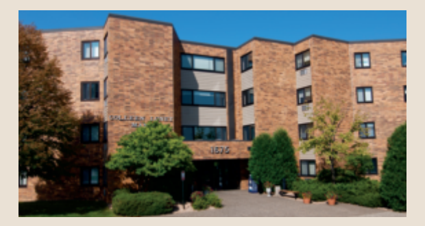
Colleen Loney Manor is an 80-unit apartment building located in West St. Paul.

PHAS inspections were established to help with the delivery of services in public housing and to enhance trust in the public housing system among public housing agencies, public housing residents, HUD and the general public. PHAS inspections provide a management tool for effectively and fairly measuring the performance of public housing agencies, like the CDA, in essential housing operations. The Colleen Loney Manor physical assessment received a score resulting in one year off from inspections.